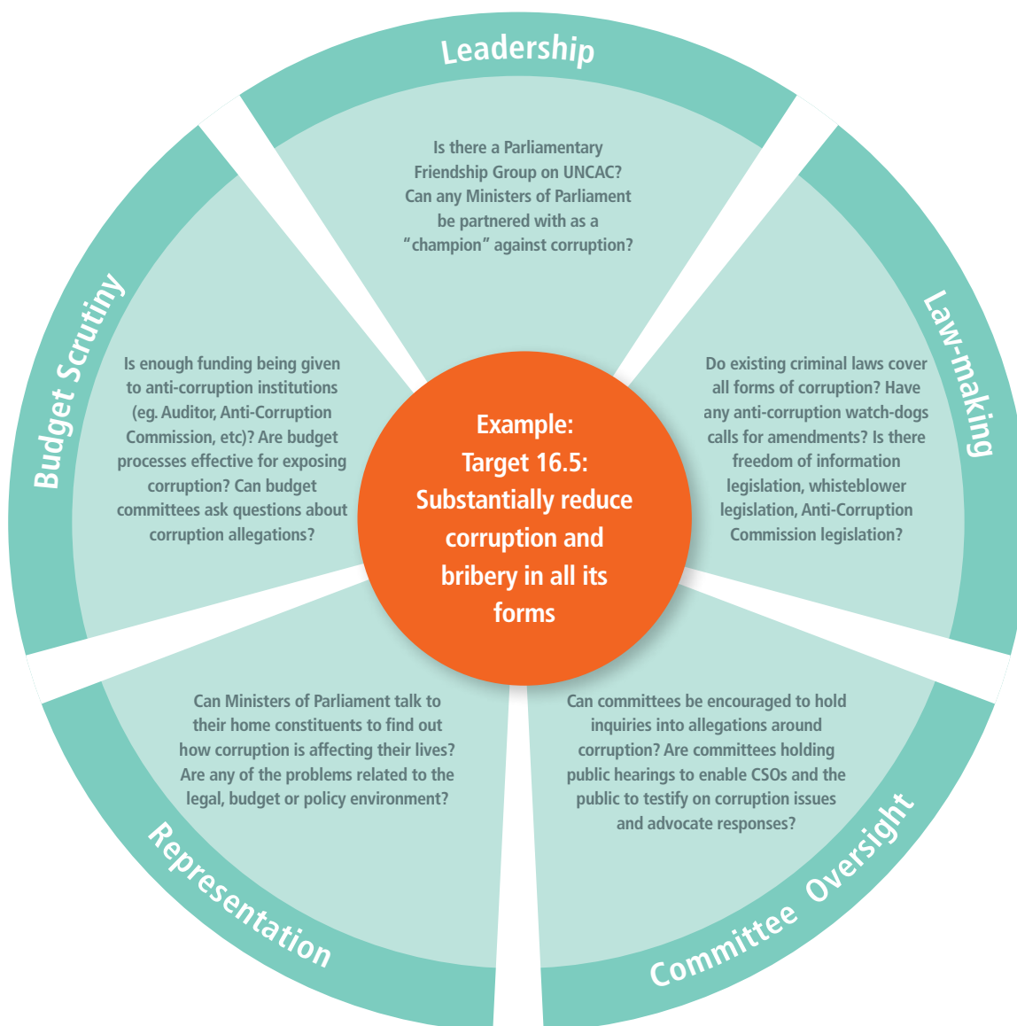
Figure 2: Example entry points for working with legislators

Although laws and amendments are commonly drafted by the executive branch, in many countries, members of the legislature can also propose their own laws (whether because the congress/assembly has its own law-making powers or through private members' bills). Where this is possible, individual legislators and/or coalitions of legislators could also be encouraged to develop draft laws. When legislators who are willing to sponsor a law or amendment are identified, civil society can provide them with technical assistance to put together a draft law. In