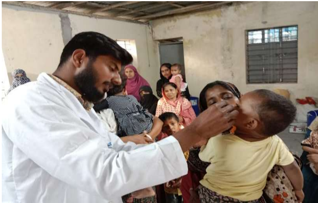
“Free healthcare support through the distribution of vitamins to pregnant mothers and polio vaccines for children.”