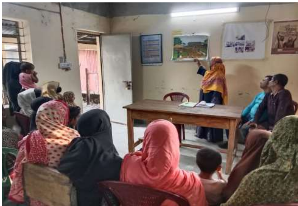
"Awareness meeting on child marriage prevention"