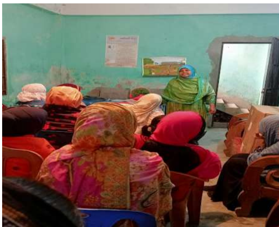
"Awareness meeting on child marriage prevention"