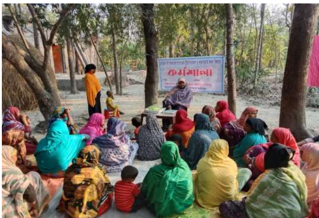
“Workshop on Quality Seed Preservation and Marketing Process among Marginalized Women Farmers.”