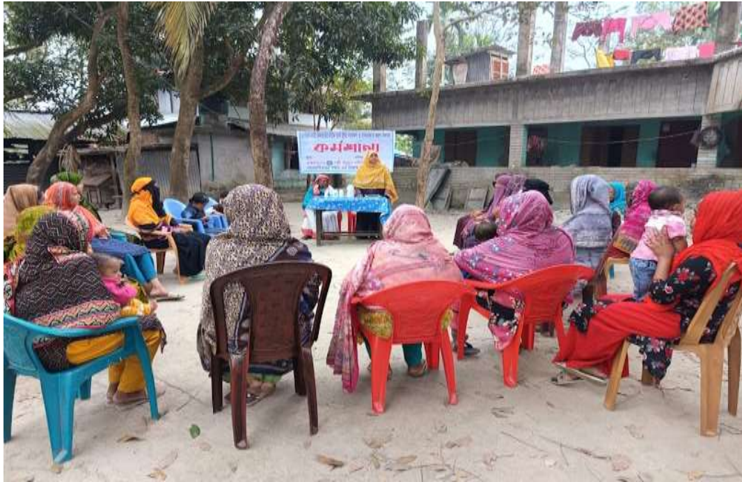
“Workshop on Quality Seed Preservation and Marketing Process among Marginalized Women Farmers.”